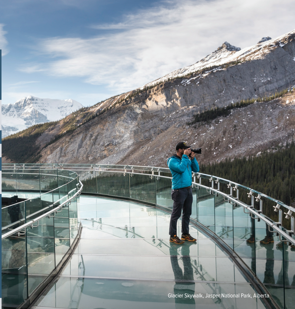
Glacier Skywalk, Jasper National Park, Alberta